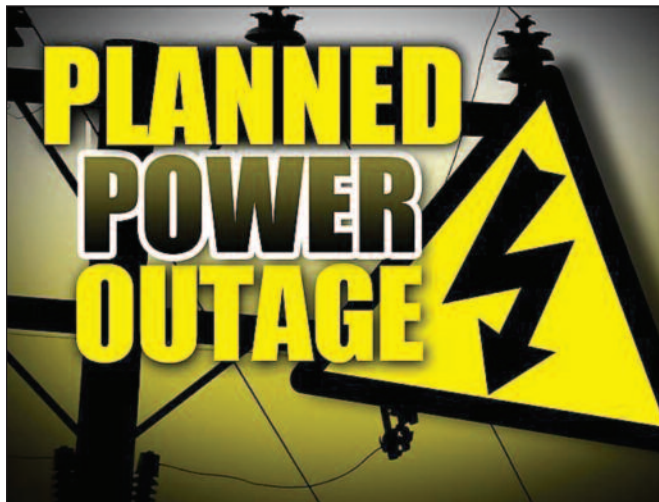
System repairs and upgrades improve service but sometimes require a planned outage.

We do our best to plan these outages during times when you will be least inconvenienced, so we often perform planned outages during school and business hours. We also try to avoid planning these outages during winter or summer months. We understand these are peak times of the year when you depend on running your heating and cooling units the most.